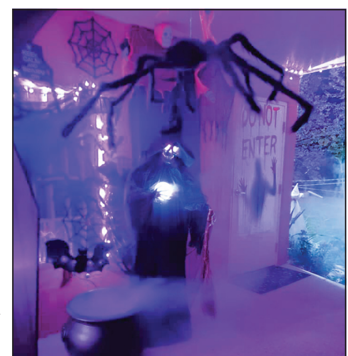
Nottely Marina has some spooky stuff for kids to do on Halloween, with plenty of candy and other activities.

"The drive-thru and all of our volunteers will be practicing social distancing with masks and whatnot as best as possible. Families will basically drive in, and they will follow a queue line See Halloween, Page 2A