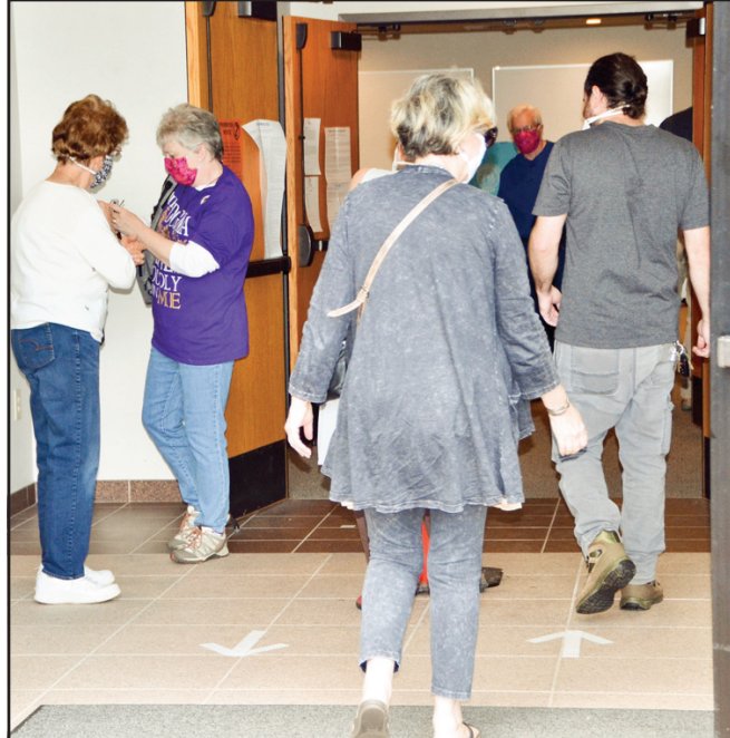
Early in-person voting for the General Election concludes

At the state level, Secretary of State Brad Raffensperger reported that, as of 5 p.m. Friday, more than 2.5 million Georgians had voted, including 1.6 million early in person and over 900,000 via See Early Voting, Page 2A